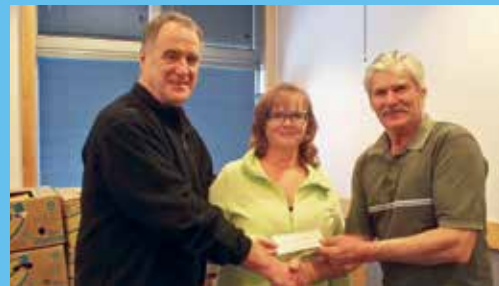
Grenville Federation of Agriculture farmers donate

As a community-governed organization within Ontario's health and social service system, we engage individuals and communities to improve health and wellbeing.